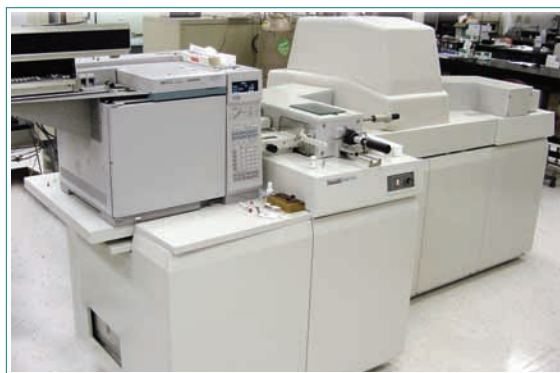
The AutoSpec Ultima HRGCMS can quantitate dioxin/furan and dioxin-like compounds to parts-per-trillion (ppt) and parts-per-quadrillion (ppq) levels.