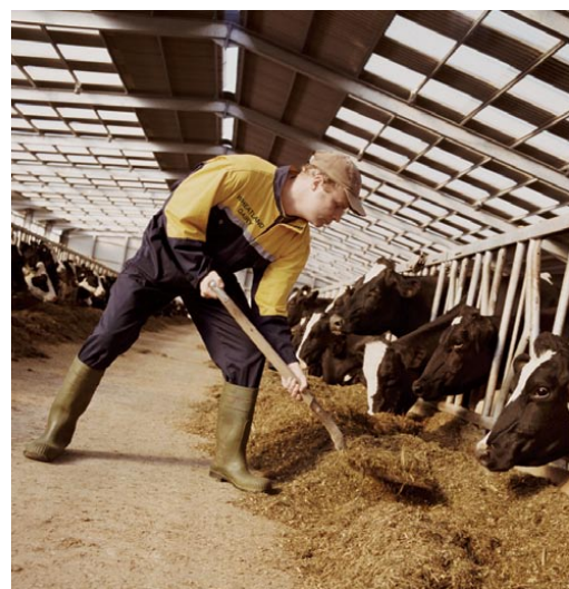
95% of human exposure is from animal fat in the diet.

You need a laboratory with the breadth of services, comprehensive quality assurance program, and global food/feed monitoring experience of Pace Analytical. The World Health Organization (WHO) has been advocating global food supply testing for toxic compounds like dioxin/furan and PCBs for several years. Following a significant food contamination event in Belgium, the European Union (EU) established safe levels for dioxin in food and animal feed. Many other countries throughout the world require dioxin testing of targeted food and feed imports. Pace Analytical provides EU and WHO compliant testing for all food and animal feed products from anywhere in the world.