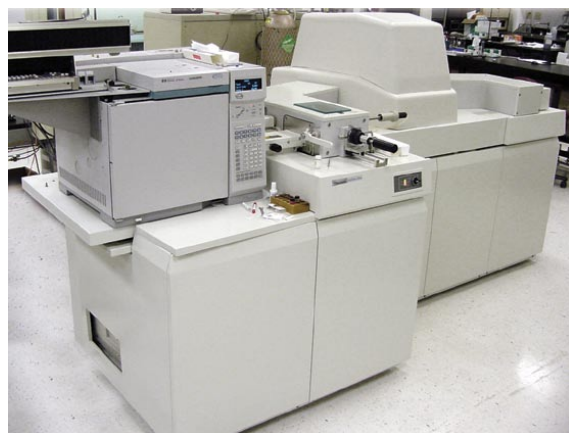
The AutoSpec Ultima HRGCMS can quantitate dioxin/furan and dioxin-like compounds to parts-per-trillion (ppt) levels in virtually all food and feed products.